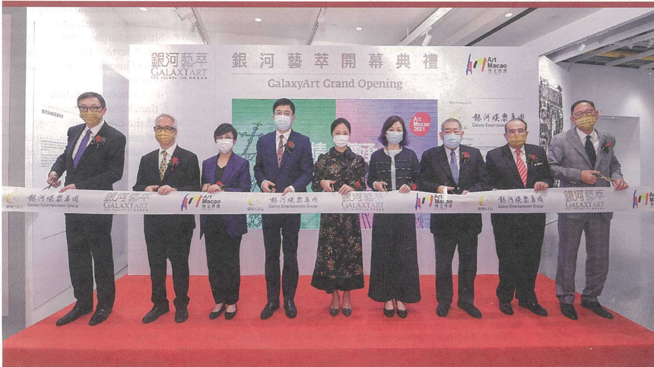
GEG unveiled the GalaxyArt Gallery, a permanent and non-profit art space at Galaxy Macau.

C ommitted to fostering the development of arts and culture in Macau, Galaxy Entertainment Group ("GEG") has supported various local arts and cultural activities aimed at enriching Macau's appeal as a cultural tourism destination and a World Center of Tourism and Leisure. Recently, the Galaxy Entertainment Group Foundation ("GEG Foundation") unveiled the GalaxyArt Gallery, a permanent and non-profit exhibition space, which GEG hopes can be used for the hosting of different arts and cultural exhibitions throughout the year, and become a key platform to support its arts and cultural initiatives.