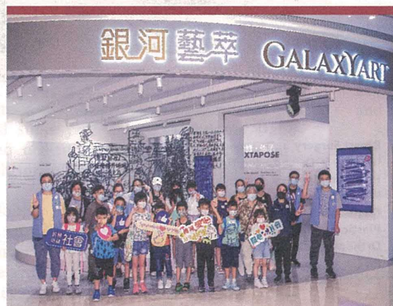
GEG invited families from BYS for a guided tour of the exhibition and to take part in a workshop.

horizons, enhanced their understanding of Macau's cultural diversity and cultivated their sense of art appreciation. We thank GEG for providing such a great opportunity for local service associations." Moreover, the participating parents also shared that the visit to GalaxyArt was very fruitful. It has helped both parents and children to learn more about the city and understand the importance of preserving culture and heritage.